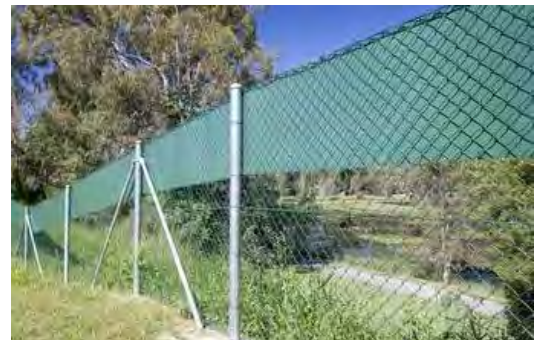
An example of koala protection fencing