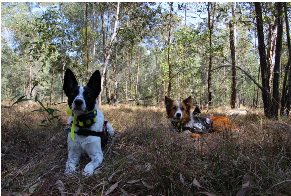
Figure 4 Koala scat detection dogs trained as part of the Section C research project