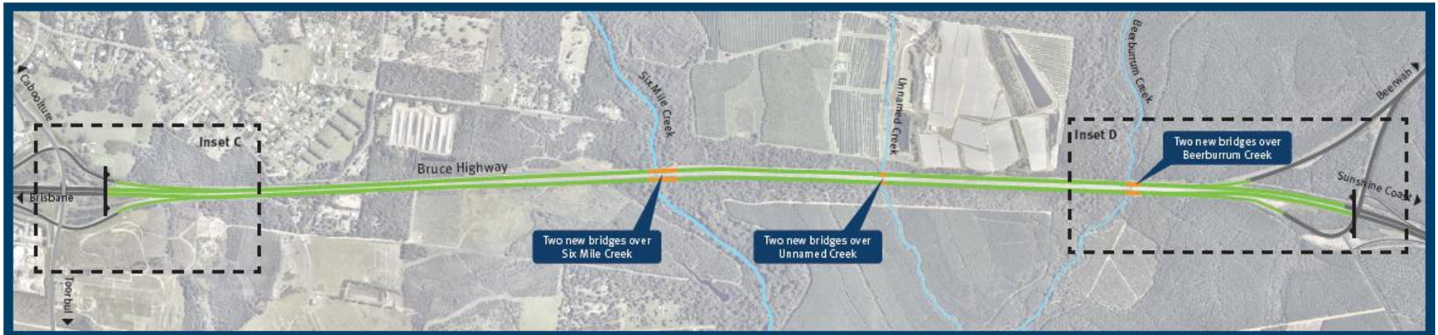
Inset C Pumicestone Road